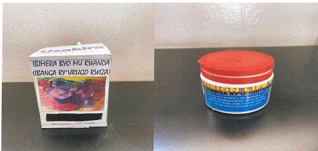
Ibanga ry' urugo rwiza