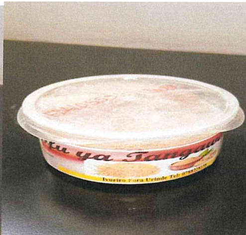
Ifu ya Tangawize