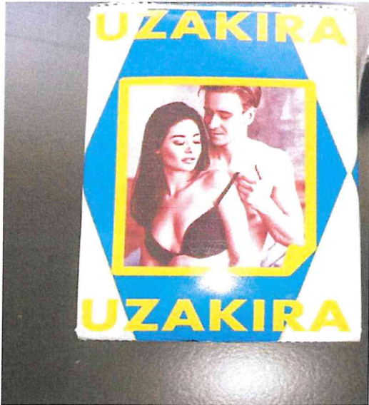
Uzakira/Muzehe wa Kazi