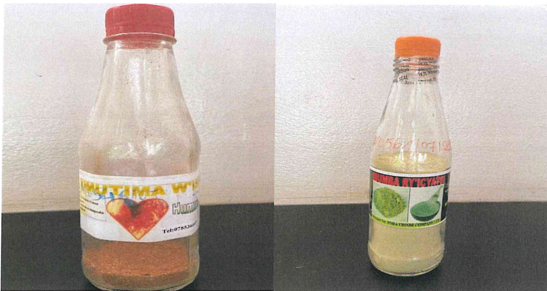
Umutima w'isi (Humura)