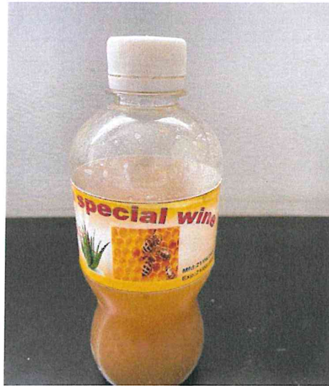
Ikimera special wine