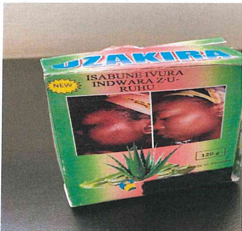
Isabune ivura indwara z'uruhu